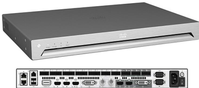
Figure 1. Cisco TelePresence SX80 Codec

Cisco offers three SX80 Integrator Packages to reduce the need for external equipment and the overall cost of enabling video in larger meeting rooms: