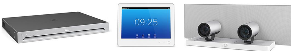
Figure 2. Cisco TelePresence SX80 Integrator Package with Touch 10 and SpeakerTrack 60

With its powerful media engine, the SX80 Codec lets you build the video collaboration room of your dreams.