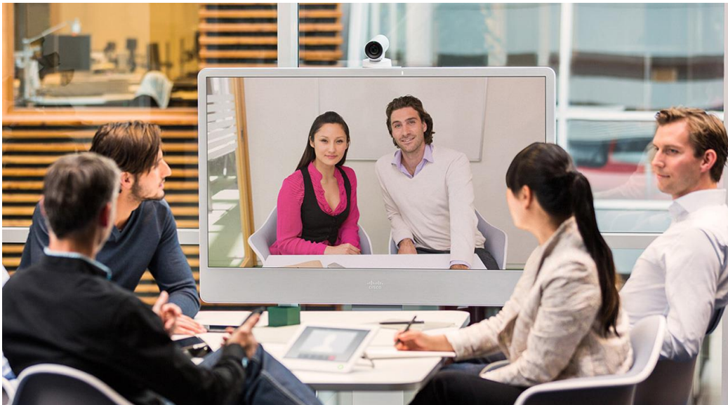
Figure 2. Cisco TelePresence MX300 G2 on Floor Stand

The Cisco TelePresence MX300 G2 and MX200 G2 are part of a complete collaboration ecosystem that offers high-quality, easy-to-use telepresence experiences that you have come to expect from Cisco, together with rapid global service and price-performance that make broad deployment easier and more affordable than ever. Whether you are just getting started with video communications or are planning to video-enable your entire organization, the MX300 G2 and MX200 G2 can meet your needs.