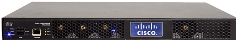
Figure 1. Cisco TelePresence MCU 5300 Series

Cisco TelePresence MCU is WebEx enabled, allowing customers to enjoy fully integrated, scalable conference involving callers from WebEx clients and telepresence endpoints.